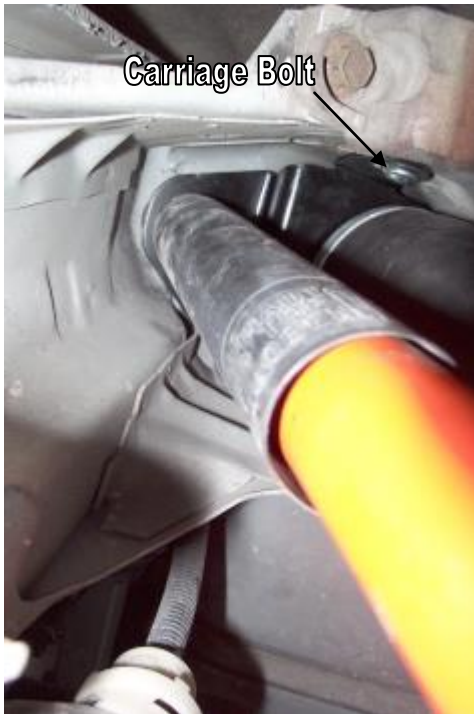
Upper Shock Mounting